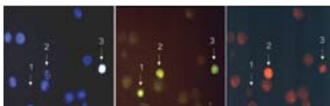
(A) DAPI (B) Ph-F (C) SR-VAD-FMK

Figure 1: Varying expressions of cellular DNA (A), cholinesterase (B), and caspase activity (C) in apoptotic Jurkat cells.